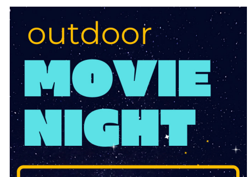
July 30 • 8:30pm • WVBC Field Free hot dogs and drinks! Showing "Ralph Breaks the Internet"

Sunday, 8/29 12:30-4:00pm Lunch Provided