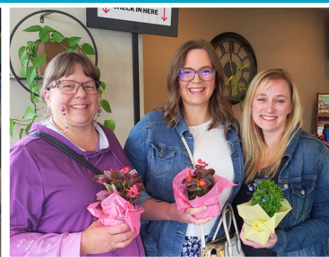
CELEBRATING MOMS! Left: Spanish Women's LifeGroup luncheon. Right: WVBC moms with flowers gifted by Men's Ministries.